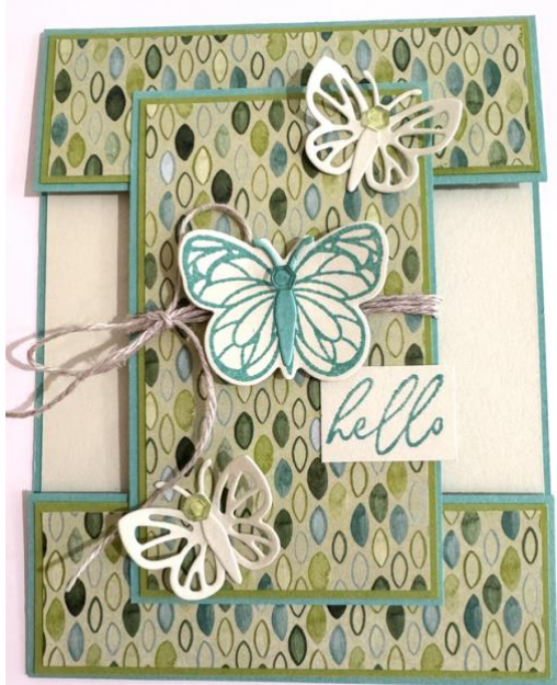
Created by Judi Hartbarger Images ©Stampin' UP!