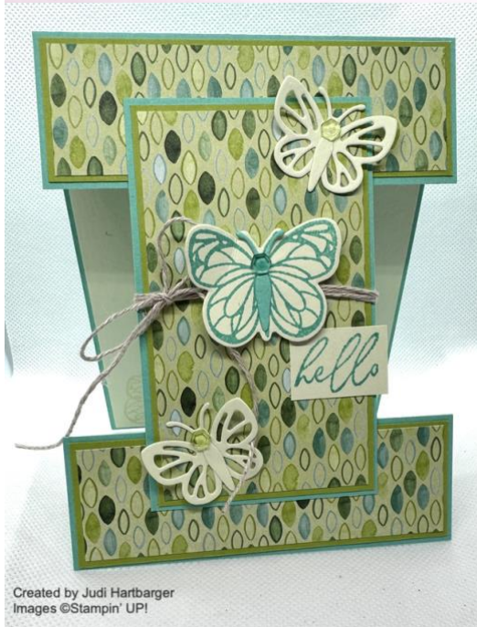
Created by Judi Hartbarger Images ©Stampin' UP!